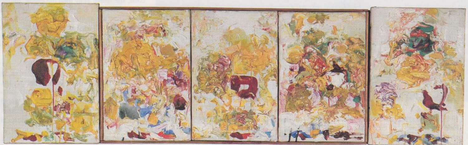
Little Trip, 1969, oil on canvas, 5 panels: 16 by 54¼ inches overall.

Storr writes, "The years in Vetheuil rewrote the critical equation which held her reputation in check." And he adds, "It was feminism that began the process of reevaluating her importance at the very time in the 1970's when the decreed death of painting seemed to have come woefully true." Still, I was disappointed that so many of Joan's obituaries were laced with rote comparisons to Monet, as she had predicted. One can only infer that the surest course to faint-praise damnation, particularly for a woman, is to be a colorist straightforwardly striving for the beautiful—as if that alone is grounds enough to call her work derivative.