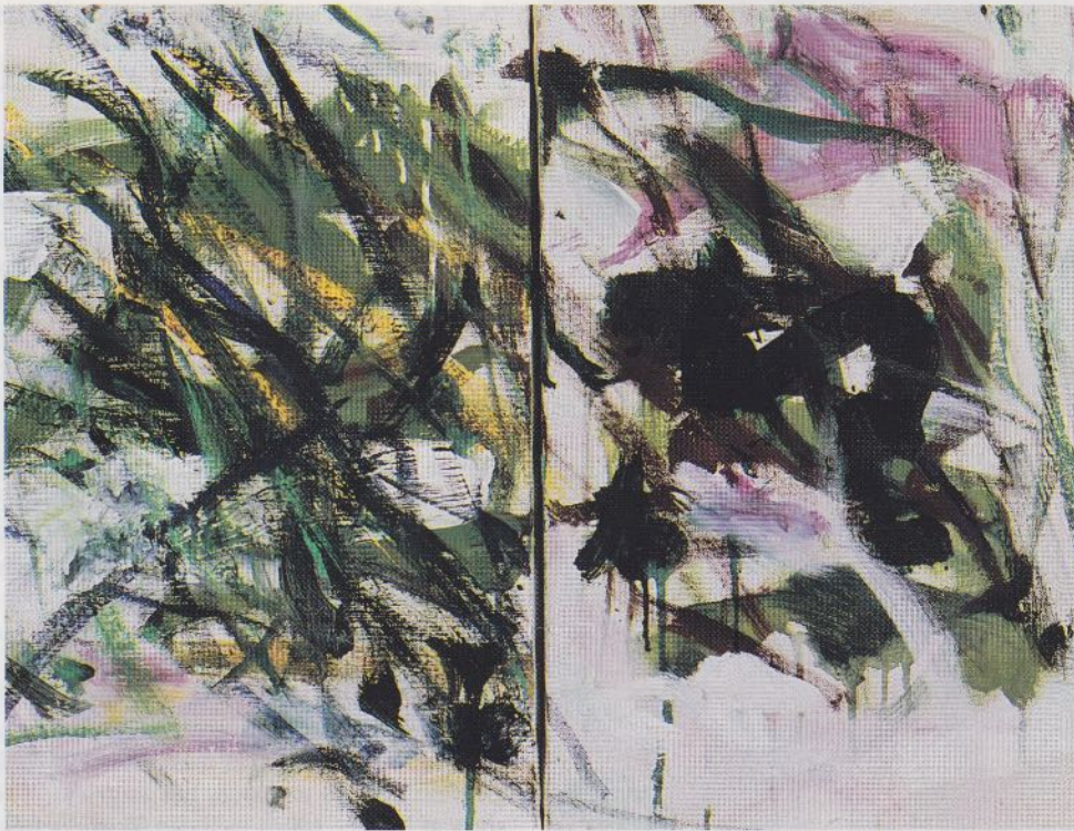
Little Rain, 1989, oil on canvas, diptych: 16¼ by 21¼ inches overall.

seen. Disgusted at the recognition, she had then stayed up until dawn to scrape it completely from her canvas so she could begin again.