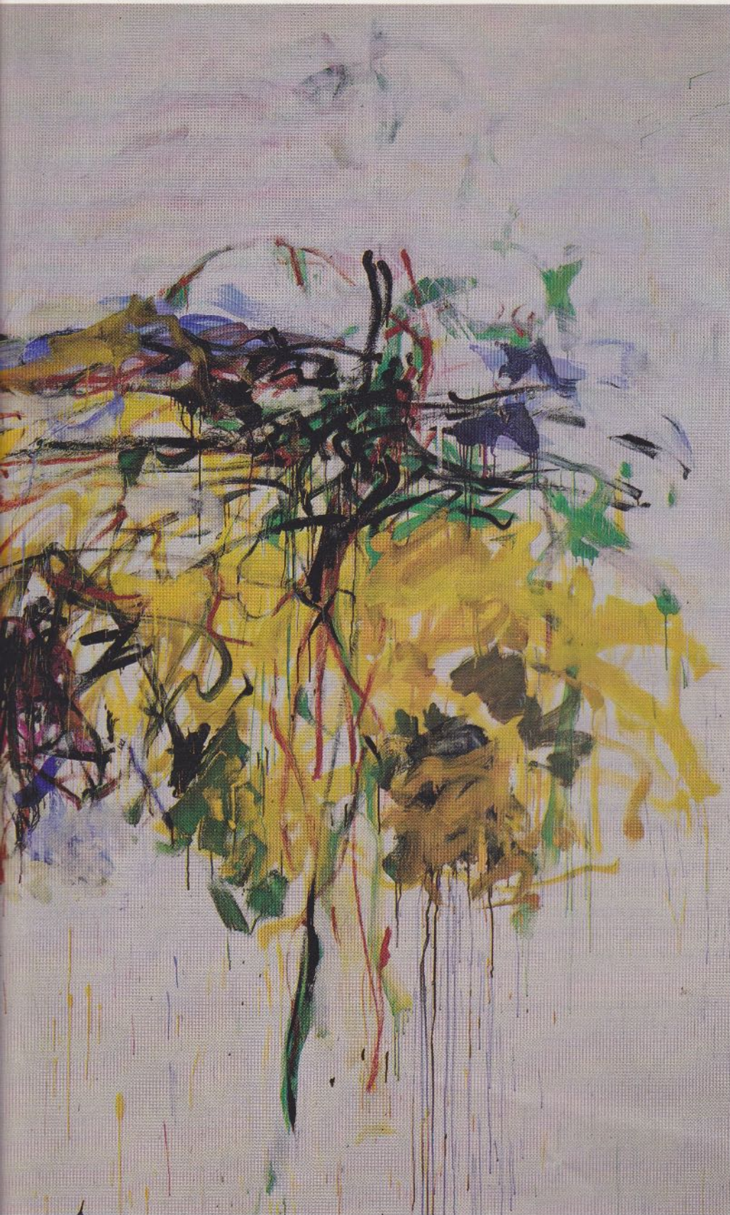
Untitled, 1992, oil on canvas, diptych: 110% by 141% inches overall.

Joan. After the late-night TV news, serenaded by the howls of her three German shepherds, Little Joan sang childhood songs as the four of them, in the moonlight, ambled up the incline to her studio behind the house. There, in the sanctuary of that room, the rest of the world fell away as she would show her newest paintings, one by one, to those who had stayed.