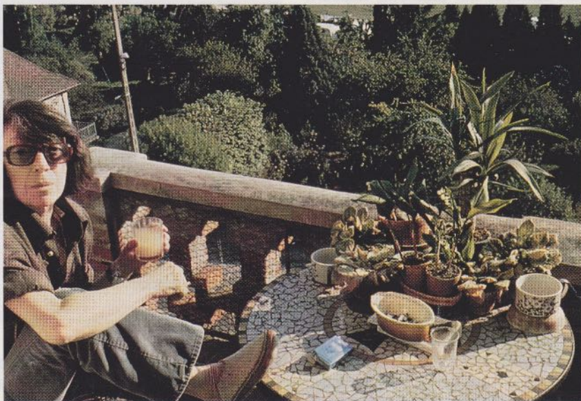
Joan Mitchell in Vetheuil, France, May 15, 1980.

I was first led to Joan in 1980, when I was 23 and staying in Paris. A friend had introduced me to some students from the Ecole des Beaux-Arts; all of them painted abstractly, and I remember being surprised when we spoke of contemporary abstract painting (which they all professed to love) that they had never heard of or seen works by either Richard Diebenkorn or Joan Mitchell. Both of these artists, expatriates of sorts from the New York art world, were like beacons for me and the company I kept back in the States. One Beaux-Arts student did know her name, but he was a bit stunned to learn