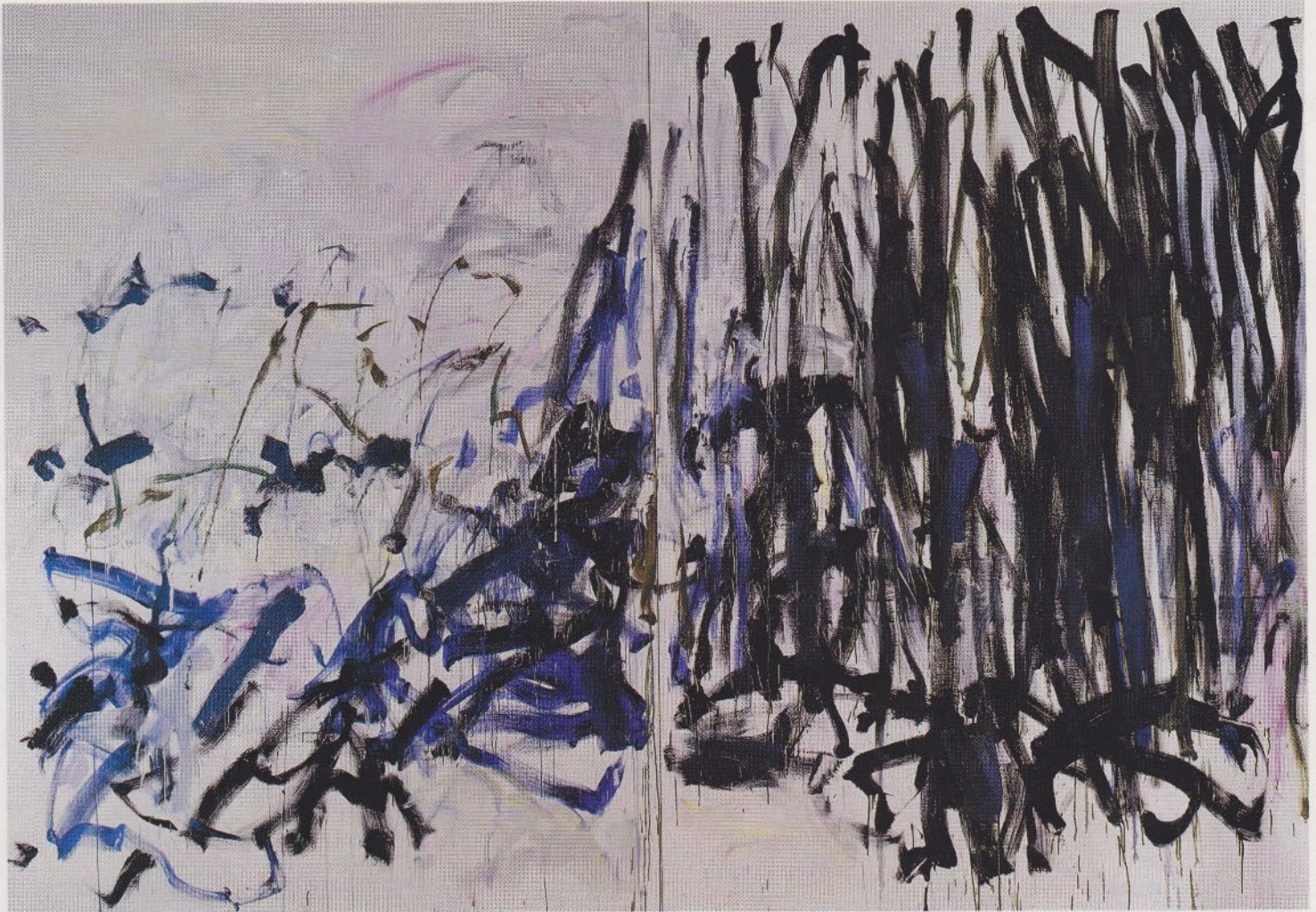
Tilleul, 1992, oil on canvas, diptych: 110% by 157% inches overall.

Joan's need to compete was unrelenting, and inevitably she did drive away some wonderful people. But our admiration for her work was what drew us back. For some of us, she revitalized painting.